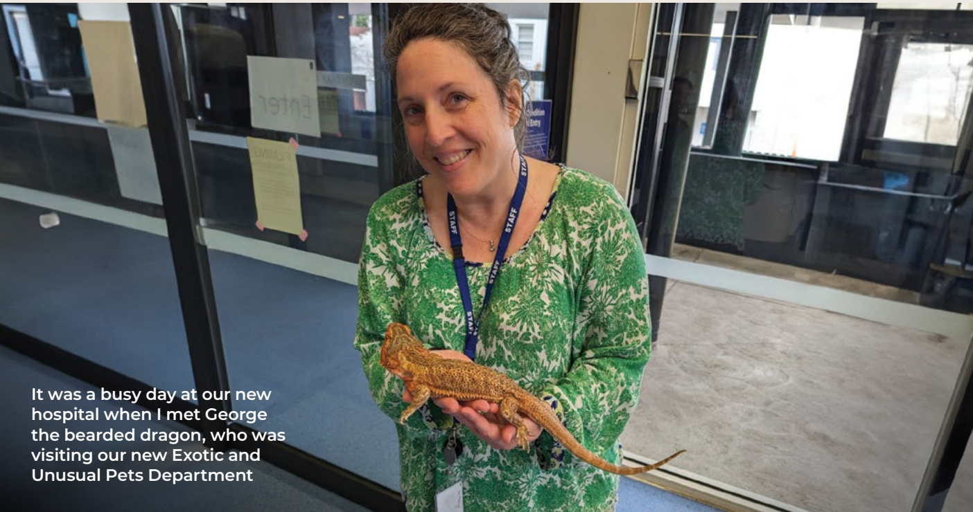
It was a busy day at our new hospital when I met George the bearded dragon, who was visiting our new Exotic and Unusual Pets Department